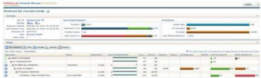
Figure 2: Enterprise Manager Cloud Control Integration